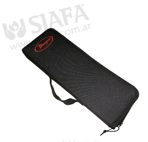
Soft Carrying Case Included with Every Unit

Weight: 16 oz (454 g). Agency Approvals: CE.