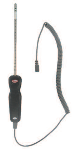
Replaceable Probe with Secure 6 Pin Adapter

AP1, Thermo anemometer air velocity & temperature probe with coiled cable UHH-C1, Soft carrying case