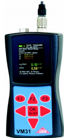
Figure 2: Vibration meter VM31

* The shown exceedance is applicable for at least 10 measurements in the same type of occupied space. If only 5 to 9 measurements are taken a maximum exceedance of 0.018 m/s 2 is allowed for one location only. No exceedance is granted for Navigation bridge and engine control room.