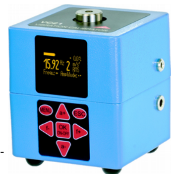
Figure 5: Vibration calibrator VC21

Please read also the VM31 instruction manual.