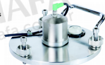
Figure 4: Tripod floor plate Mod. 729

Useful accessories for the measurement of ship vibration may be the tripod floor plate Model 729 (Figure 4) and the magnetic base Model 508.