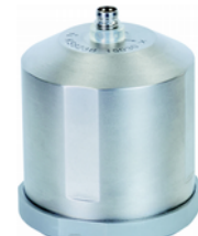
Figure 3: KS823B