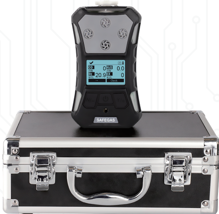
SKY3000 — Portable gas detector

SKY3000 series is a high-performance portable gas detector that can detect multiple gases (Oxygen compounds VOC, combustible gas and toxic gas) at the same time and has man down alarm function. The device has humanized operation functions such as one-key security detection, one-key storage, automatic image flipping, as well as the man down alarm function; With optional Bluetooth transmission function, allowing safety personnel to obtain real-time data and the alarm status. It has obtained international IECEx, ATEX explosion-proof certification and Chinese explosion-proof certification; As it passed the antistatic test, and the protection level reaches IP67; With safer product design and the module design which makes the detection faster, and the compact ergonomic design makes the device easy carrying; What's more, the device is also a suction and diffusion dual-purpose instrument. The instrument is mainly working in suction mode. When the air pump fails or in special emergency situations, it can automatically switch to the diffusion sampling method, thereby improving the protection to a new Level.