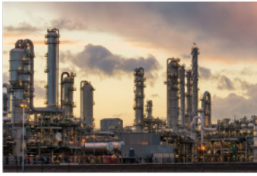
▲ Petrochemical & Chemical Industry