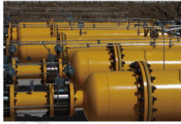
▲ Municipal Engineering & Utilities