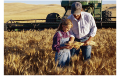
▲ Agricultural & Environmental Protection