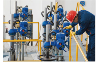
▲ Other Industries