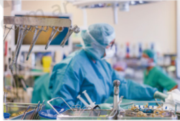
▲ Food & Pharmaceutical Industry