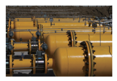
A Municipal Engineering & Utilities